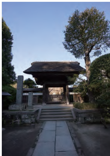
After passing through the thatched sammon gate, visitors will see a row of cherry trees.