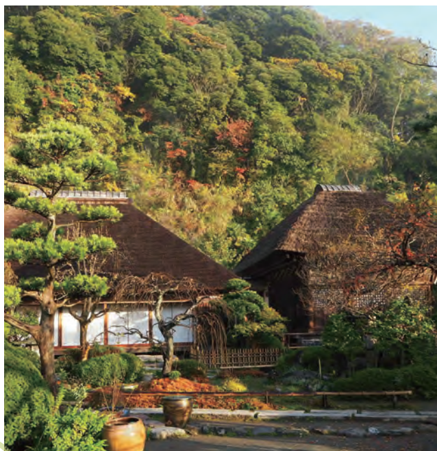
The thatched roofs are beautiful against the green of the valley.