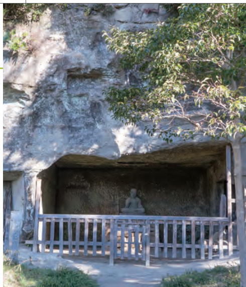
Amihiki Jizo yagura at Jokomyoji Temple

There are many valleys in Kamakura and artificial caves called yagura can frequently be seen on the slopes of these valleys. They were used during the Middle Ages by the ruling class, including samurai and priests, to house tombs and cenotaphs. Following cremation, ashes in an urn were often placed in a yagura together with a gorinto , a five-ringed tower. It is said that yagura were one way to maximize the limited space in Kamakura. Many yagura can be found in the valleys behind temples such as Kakuonji Temple, Jokomyoji Temple and Zuisenji Temple. Famous yagura include those which contain the cenotaphs of Hojo Masako and Minamoto no Sanetomo at Jufukuji Temple, those in Urigayatsu where images of Buddha and gorinto are carved into the rock, and the 108 yagura behind Kakuonji Temple.