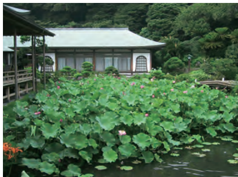
Kishu Garden of Komyoji Temple. An event to admire lotus flowers is held in July.

Komyoji Temple is one of Kamakura's largest temples. Founded by Hojo Tsunetoki, this temple became the center for the practice of the Jodo School of Buddhism in the Kanto region. The sammon gate at the entrance is the largest temple gate in Kamakura. Set in spacious grounds, the Main Hall (an important national cultural asset) is the largest hall in Kamakura. The Kishu Garden, with a lotus pond at its center, is located on the north side of the hall, and there is a rock garden on the south side. From the hill behind the temple you can see the beach at Zaimokuza and the Inamuragasaki cape through the trees.