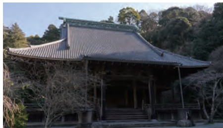
The soshido hall has a massive tiled roof.