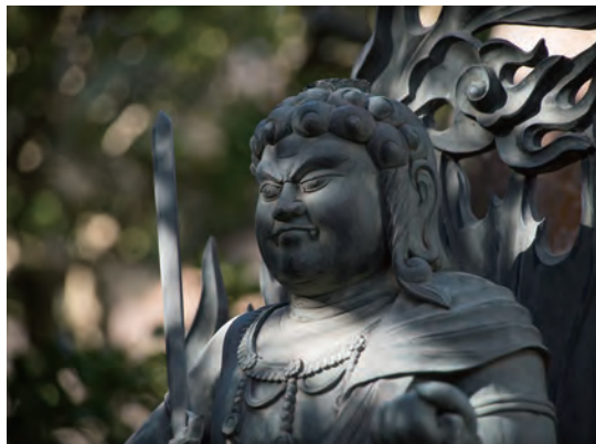
The goma kuyo fire ritual conducted in front of gomafuda, an avatar of Fudo Myoo, the principal image of the temple.