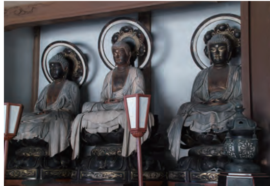
Sanzebutsu, which represents past, present and future, is in the style of the Kamakura Period.