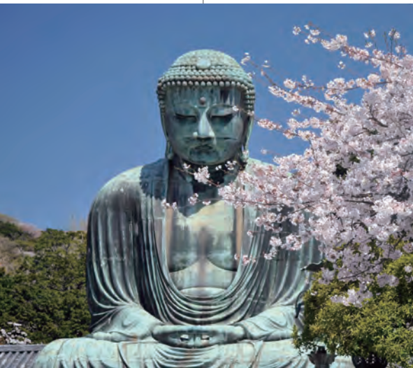
Daibutsu surrounded by spring cherry blossoms.