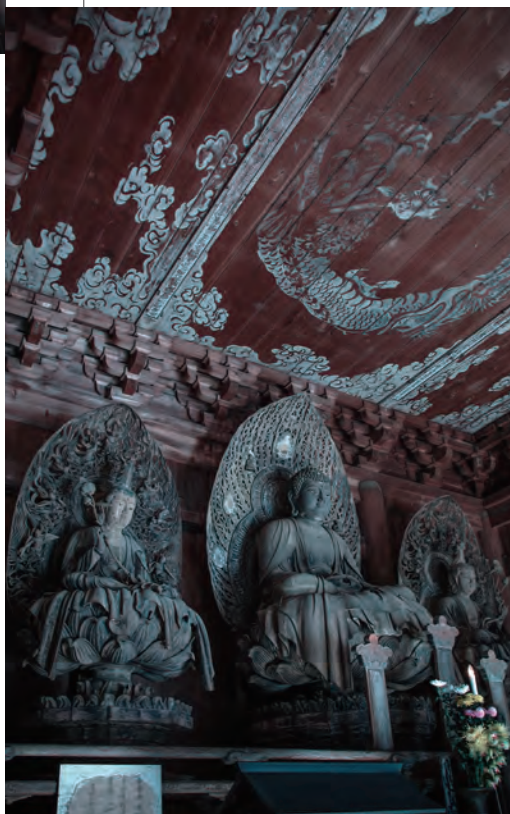
The principal images are statues of Yakushi Sanzonzo surrounded by the twelve divine generals.