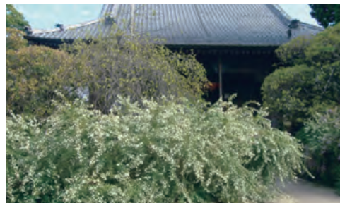
In fall many white bush clovers bloom in front of the main hall and along the approach to the temple.