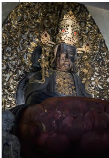
The statue of a seated Hokan Shaka-nyorai in the main hall is notable for the coronet it wears.