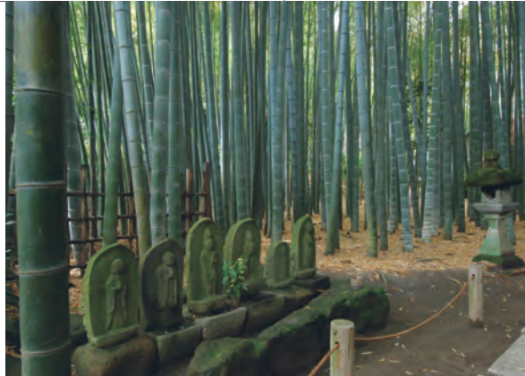
The Bamboo forest is very popular with visitors. The mountain behind the temple is studded with tombs.