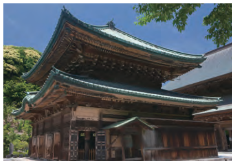
The anniversary of the Buddha's death, the Buddha's birthday and the anniversary of the founder's death are commemorated each year in the lecture hall and the Buddha hall.