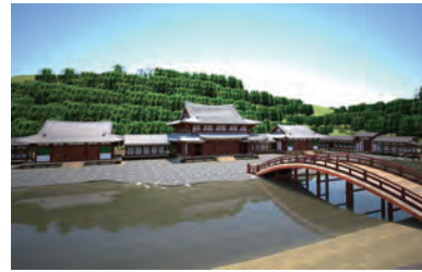
Computer graphic of Yofukuji Temple (created by Shonan Institute of Technology)

In the 1189 Oshu (Tohoku) Region Wars, Minamoto no Yoritomo won an overwhelming victory against Fujiwara no Yasuhira, and cemented the hegemony of the samurai government in Eastern Japan. During the campaign, Yoritomo was so impressed by the two-story Nikaidaido Daichojuin at Chusonji Temple in Hiraizumi in North-East Japan that he built a copy called Yofukuji Temple in Kamakura. The area around it came to be known as the Nikaido (literally meaning a "two-story hall"). Based on archeological investigations, a part of the temple has been recreated and visitors can see the layout of the temple buildings, garden and pond.