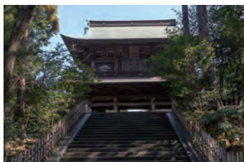
Sammon gate of Engakuji Temple.