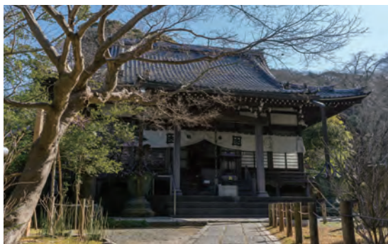
The main hall. The trail leading to the Nanmenkutsu cave is to the right of the hall.